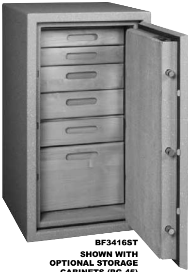
BF3416ST SHOWN WITH OPTIONAL STORAGE CABINETS (PG 45)