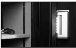
OPTIONAL BATTERY OPERATED LIGHT KIT AVAILABLE FOR ALL MODELS. SEE PAGE 25 FOR DETAILS.