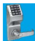
With IC Core in 26D DL2700iC/26D