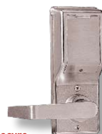
Secure battery compartment on inside door