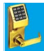
Lever set in US3 DL2700/3