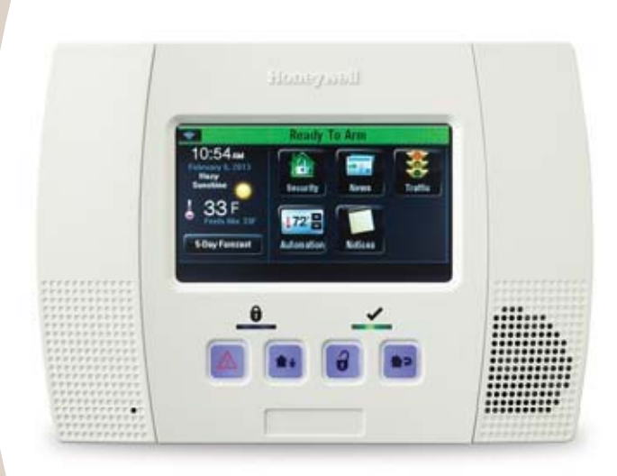
Sleek, stylish look suits any décor.

LYNX Touch Self-Contained Homee ControlSystem